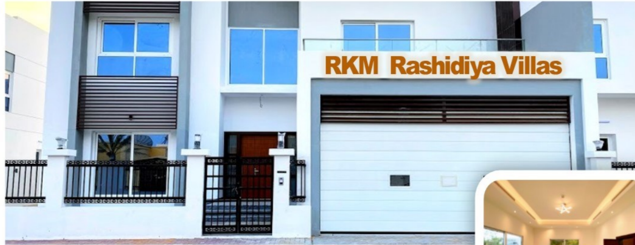
RKM Rashidiya Villas