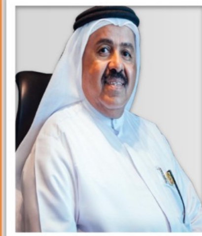
RKM Rashidiya Villas